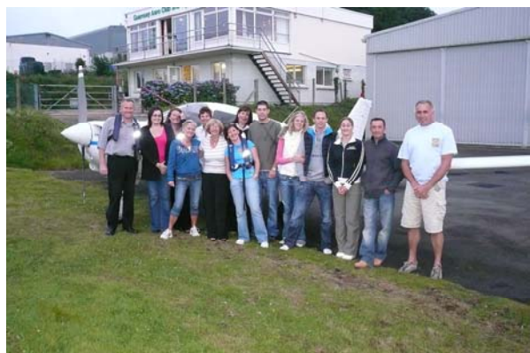
A group of flyers with their instructor in front of a Piper Warrior aircraft at the Guernsey Aero Club.

The projector has already been bought and put to good use.