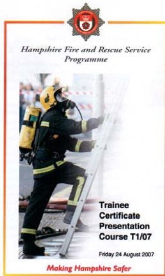
The front cover of the programme